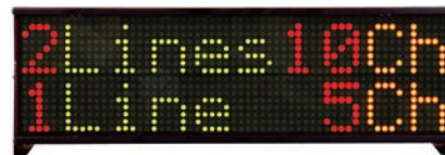
TRI color Indoor