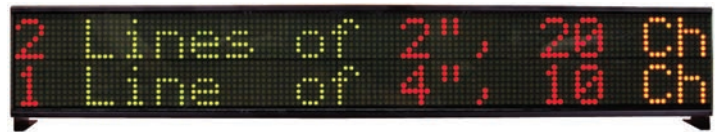
TRI color Outdoor